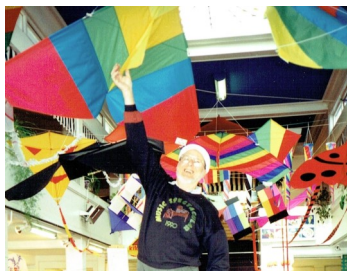
A passion. "Promoting Kites"